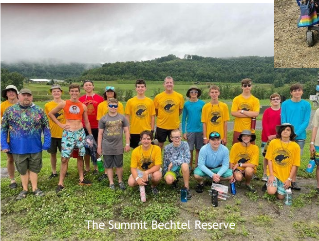
The Summit Bechtel Reserve