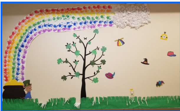
St. Patrick's Day and Crazy Hat Days

We also are accepting camp applications for children 3-6 years of age. These are also found on our website. This year camp themes are Camping Adventures (June 8-11) and Camp Disney (June 15-18).