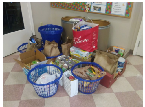
Donations from the 12/19 Drive By Donation Event