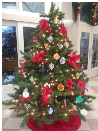
Ornaments on display