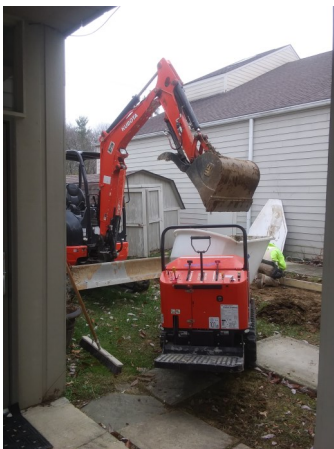
Axl pouring the new concrete slabs